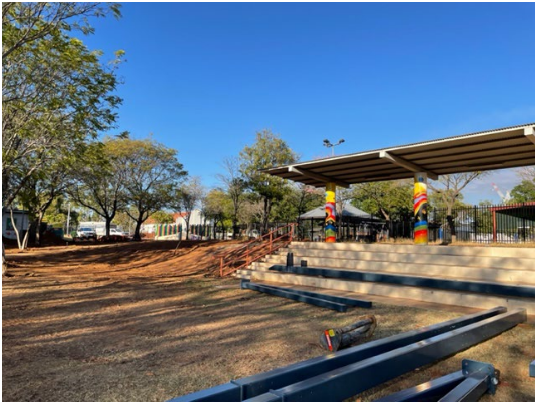
Completed stage removal, earthworks to regrade existing retaining wall and drainage, pre fabricated steel for seats and interpretive signage. Subbase material for footpaths and spine. Hold down bolts and civil works complete for Amphitheatre shade structure parklands, drainage