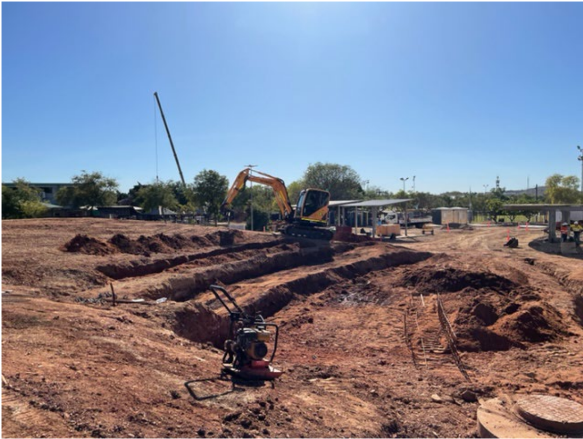
EARTWORKS WITHIN FUN PARK INCLUDING. 700M3 OF IMPORTED FILL, SHAPED THE MOUND, CUT IN 3 TIER IN GROUND BENCH SEATS, FOLLOWED BY UTILITY TRENCHING WORKS FOR DRAINAGE, UNDER SEAT LIGHTING, POTABLE WATER, DETAILED EXCAVATIONS WORKS AROUND EXISTING SHELTER, INCLUDING THE 4 NEW SHELTER SLABS, BBQS AND FOUNTAINS